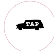
The Tap Truck