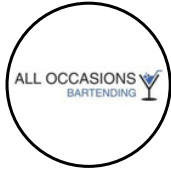
All Occasions Bartending