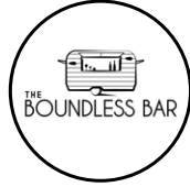
The Boundless Bar