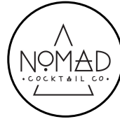
Nomad Cocktail Co.