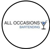
All Occasions Bartending